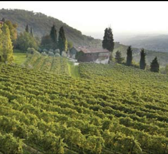
The vineyard of San Ciriaco in the Valpolicella Classica hills