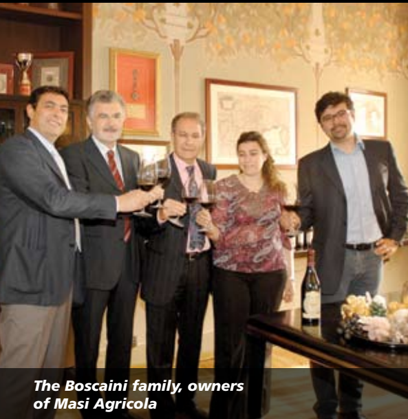
The Boscaini family, owners of Masi Agricola