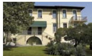
Masi Agricola headquarters in Gargagnago

The history of Masi Agricola is the history of its vineyards around Verona, in the Venetian region. The name derives from "Vaio dei Masi", the little valley acquired in the late 18th century by the Boscaini family, who retains ownership to this day. The company has grown step by step through successive, carefully considered purchases in the best viticultural areas of the Venetian region. Masi Agricola is also involved in the management of the most historic estate in Valpolicella, which has belonged to the noble Serego Alighieri family, descendants of the poet Dante, since 1353. More recently Masi Agricola has developed new projects in Argentina and, in collaboration with Serego Alighieri, in Tuscany.