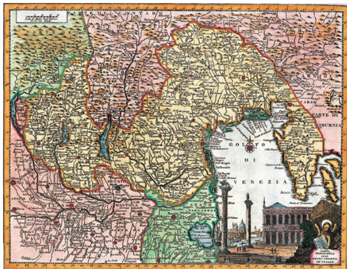
In the historic Venetian area, the premium viticultural zones are to be found on hilly terrain.

wine that the producer imbues with the viticultural, enological and cultural values of the Veneto through the use of modern wine-making methods. In short, it demonstrates the excellence of its terroir, the outstanding character of local grapes, and the unique-