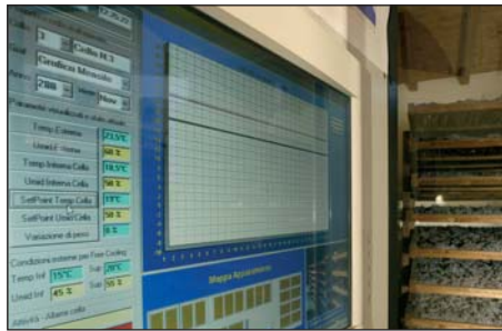
Photo 3: «Natural appassimento super assisted» in the Gargagnago drying loft.

such as, for example, the single vineyards of Mazzano, Campolongo di Torbe and Vaio Armaron, the historic Serego Alighieri cru site. Masi agronomists and enologists are well aware that Amarone is a wine unique in its origins, its ancient grape varieties (Corvina, Rondinella and Molinara) and its production methods (vinification of grapes that have been semi-dried on racks for 3 to 4 months),